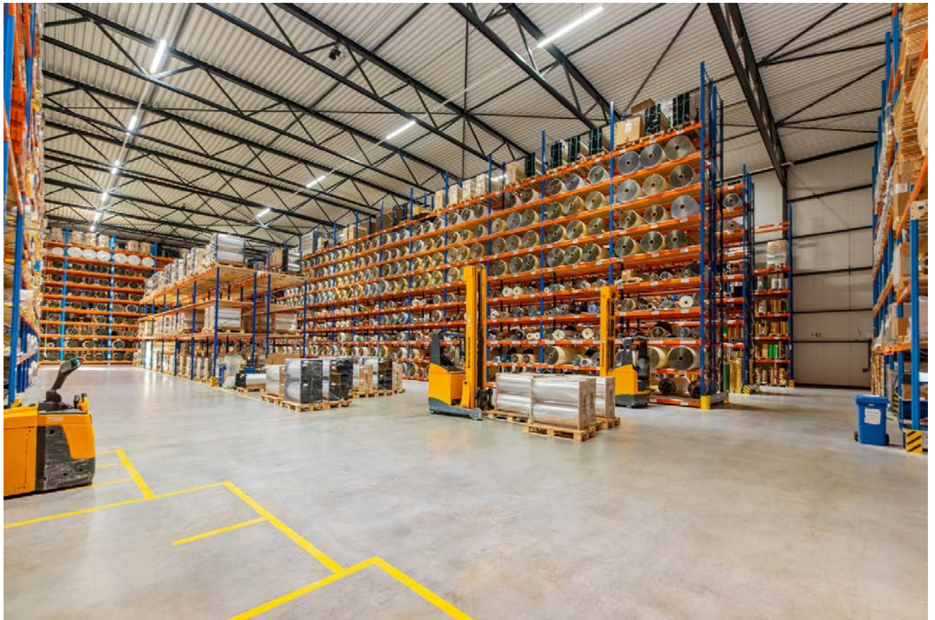
Caption: Modern heavy-duty high-bay warehouse over approx. 20,000 m 3 with high stock levels for maximum availability