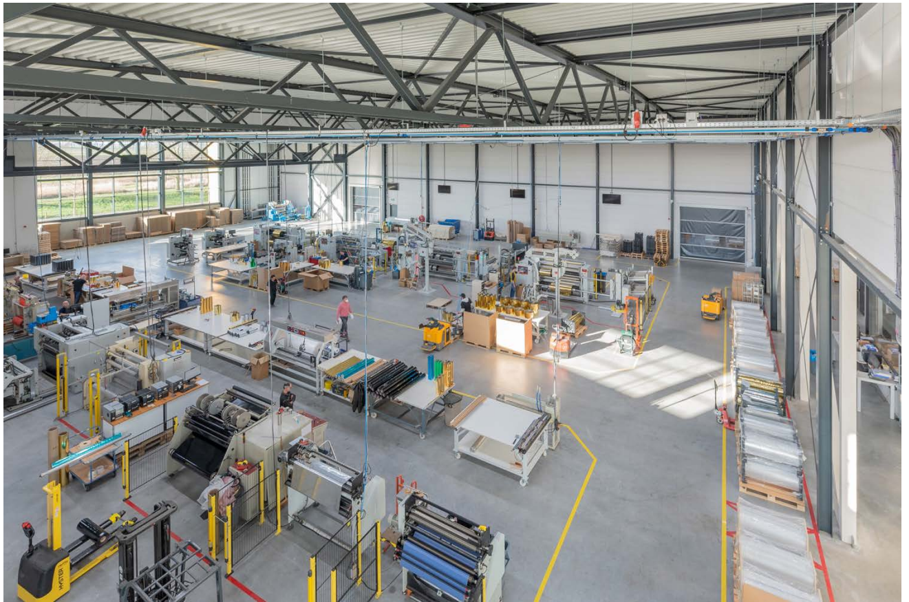
Caption: Production area over 2,100 m 2 - fully air-conditioned, highly ergonomic and flooded with daylight.